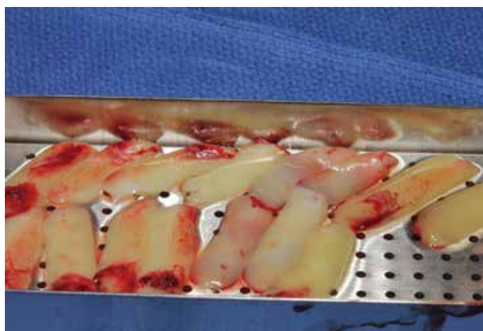
Figure 4: The APRF membranes are fabricated after pressing the cover of the PRF box until a uniform membrane is created.