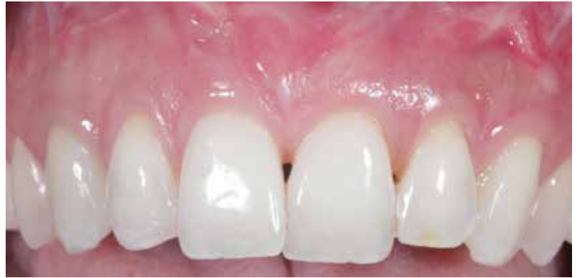
Figure 14: Two years postoperative; note the complete root coverage and the increase of keratinized and attached tissues.