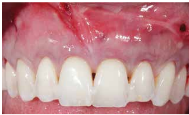
Figure 10: The complete flap relaxation combined with adequate volume of APRF membranes displaces the flap coronally without tension.