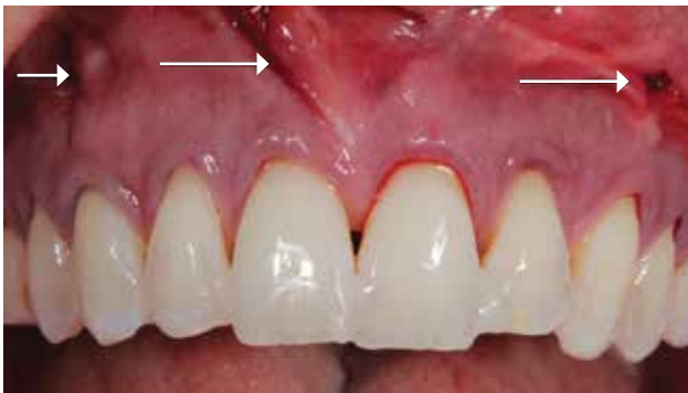
Figure 5: Three vertical incisions in the mucosa allow for a horizontal instrumentation of the flap (white arrows). Flowable composite is placed in between the teeth to retain sutures.

// FASTP is a simplification of the vestibular incision subperiosteal access technique... //