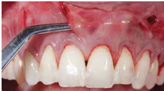
Figure 9: The APRF membranes are inserted from distal to mesial. Three to four membranes are used per pair of teeth.

A flowable composite (Elegance, Henry Schein) was used between the teeth without any preparation (no etching or primer). The shrinkage after light-curing physically locks the composite material between the teeth and provides support for the sutures. Approximately two-and-a-half weeks later, the sutures were removed and the composites separated from the incisal edges of the teeth with a curette (Fig 13).