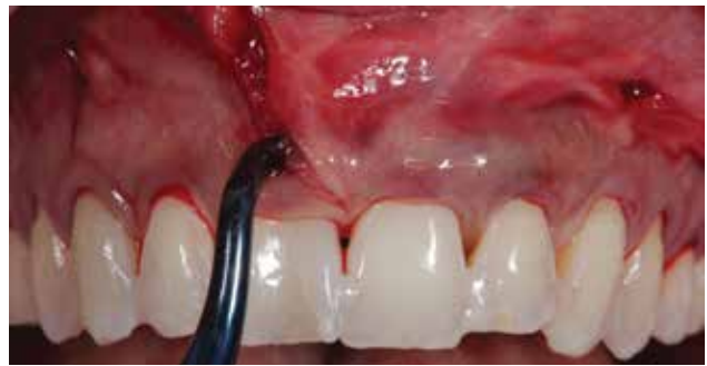
Figure 6: Complete flap relaxation is obtained by raising a full thickness flap. The papillae are elevated but not separated from the flap.