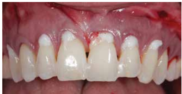
Figure 8: The roots are planed and detoxified twice with EDTA 17% for two-and-a-half minutes and rinsed copiously.