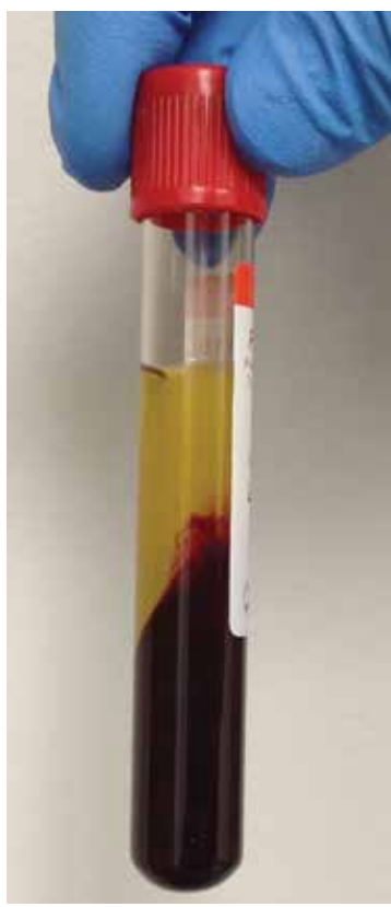
Figure 2: A 10-ml APRF tube with the fibrin clot obtained after centrifugation. Note the separation, with the red corpuscles at the bottom of the tube.

Each 10 ml of blood drawn will produce one APRF membrane. Three to four membranes are recommended for each pair of treated teeth. The APRF tubes are spun in a centrifuge (Process Ltd.; Nice, France) at 1300 rpm for eight minutes. 8 The fibrin clots formed are filled with growth factors, stem cells, and leukocytes. The clots are compressed in a special container (PRF box, Process Ltd.) and formed into membranes that can be used for the clinical application (Figs 2-4).