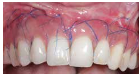
Figure 13: Two weeks postoperative; note the uneventful healing.