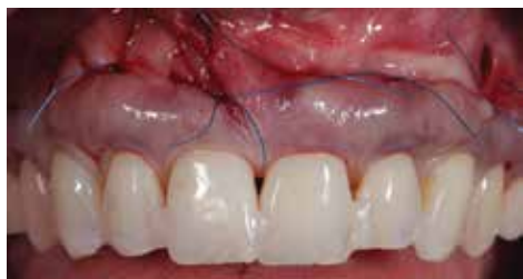
Figure 11: Deep apical mattress sutures keep the APRF membranes on the roots and protect the flap against vertical muscles of mastication pull.