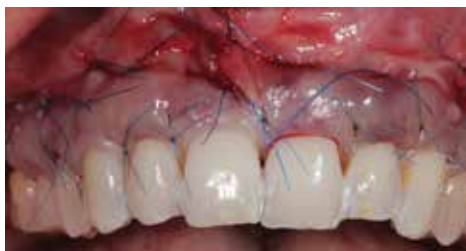
Figure 12: Interproximal sling sutures coronally advance the flap on the roots.