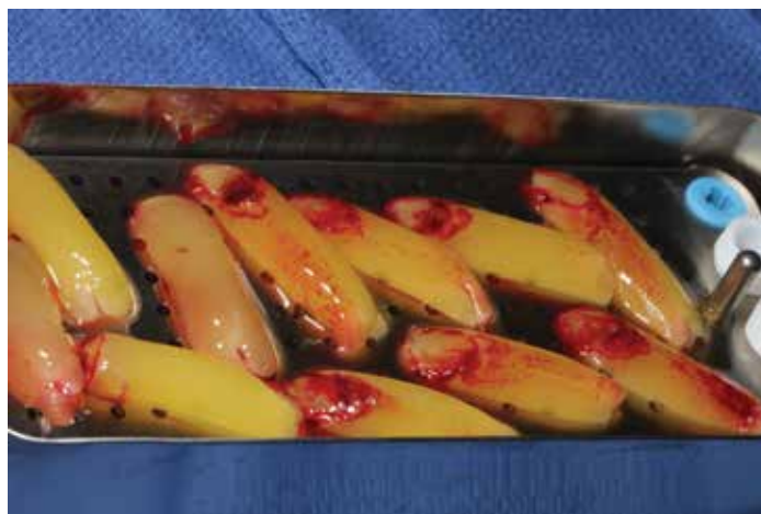
Figure 3: The APRF clots are placed into the PRF box, ready to be compressed. Note that the red corpuscles are discarded.