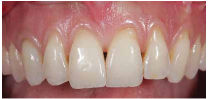
Figure 1: Preoperative image showing gingival recession on the maxillary anterior sextant.

She was diagnosed with Miller Class II and III trauma-induced gingival recession, the latter with interproximal attachment loss ( Fig 1 ). 17 The prognosis was good for the increase in volume of the keratinized and attached tissue and was an expected 90% for the root coverage (due to mild bone loss).