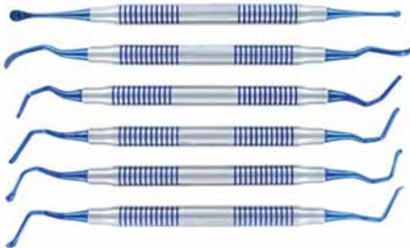
Figure 7: Offset curettes used to achieve the flap dissection.